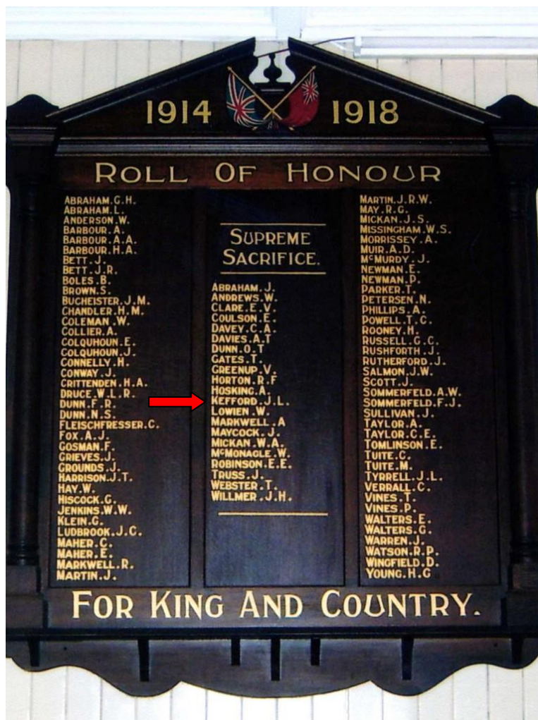
Kumbia School of Arts WW1 Roll of Honour