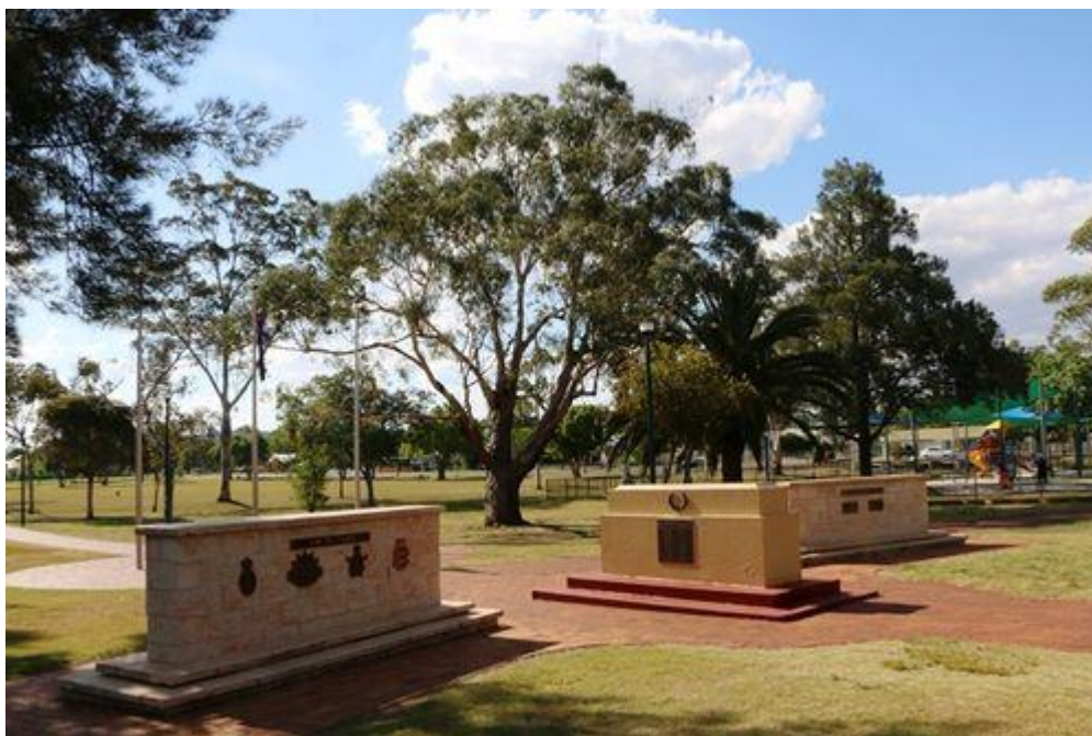
Stone of Remembrance, Kingaroy