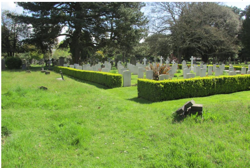
Bournemouth East Cemetery